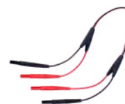
double-wire test lead 0.6 m