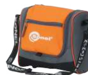
M-6 carrying case