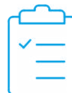
Calibration cer- tificate with accreditation