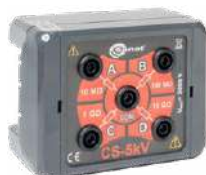
CS-5kV calibration box