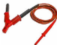
Test lead 15 kV 3 m CAT IV 1000 V with crocodile clip, red