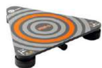
PRS-1 resistance test probe