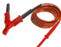
Test lead 15 kV CAT IV 1000 V with crocodile clip, red 1.8 m / 5 m / 10 m / 20 m

WAPRZ1X8BLKROE15KV WAPRZ005BLKROE15KV WAPRZ010BLKROE15KV WAPRZ020BLKROE15KV