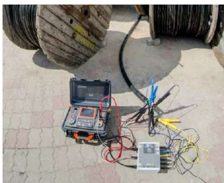
Several measurements in one connection