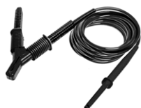
Test lead 15 kV CAT IV 1000 V with crocodile clip, black 1.8 m / 5 m / 10 m / 20 m

WAPRZ1X8BLKROE15KV WAPRZ005BLKROE15KV WAPRZ010BLKROE15KV WAPRZ020BLKROE15KV