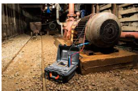
For the toughest working conditions