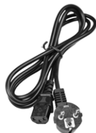
Mains cable with IEC C13 plug