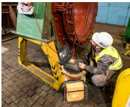
Professional diagnostic tool