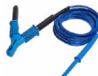
Test lead 15 kV CAT IV 1000 V with crocodile clip, blue 1.8 m / 5 m / 10 m / 20 m

WAPRZ1X8REKRO15KV WAPRZ005REKRO15KV WAPRZ010REKRO15KV WAPRZ020REKRO15KV