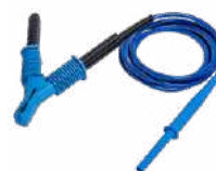
Test lead 15 kV 3 m CAT IV 1000 V with crocodile clip, blue