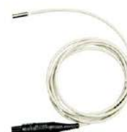
ST-1 temper- ature probe