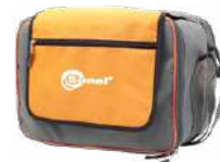
L4 carrying case