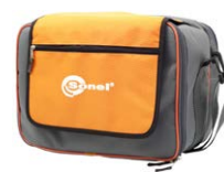
L4 carrying case