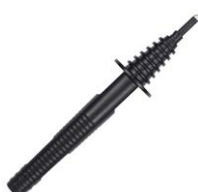
Pin probe 11 kV (ba- nana socket) black