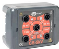
CS-5kV cali- bration box

WAPRZ003REBB10K WAPRZ005REBB10K WAPRZ010REBB10K WAPRZ020REBB10K