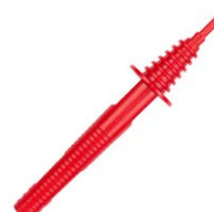
Pin probe 11 kV (banana socket) red